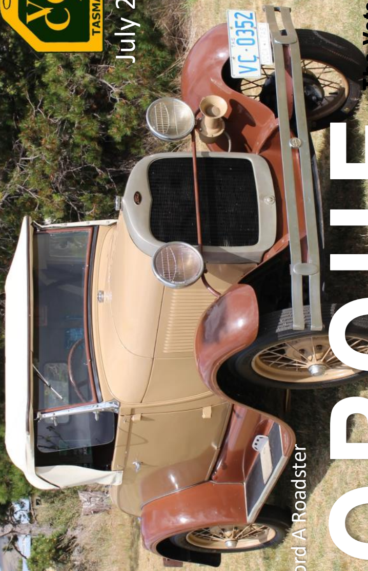
1928 Ford A Roadster